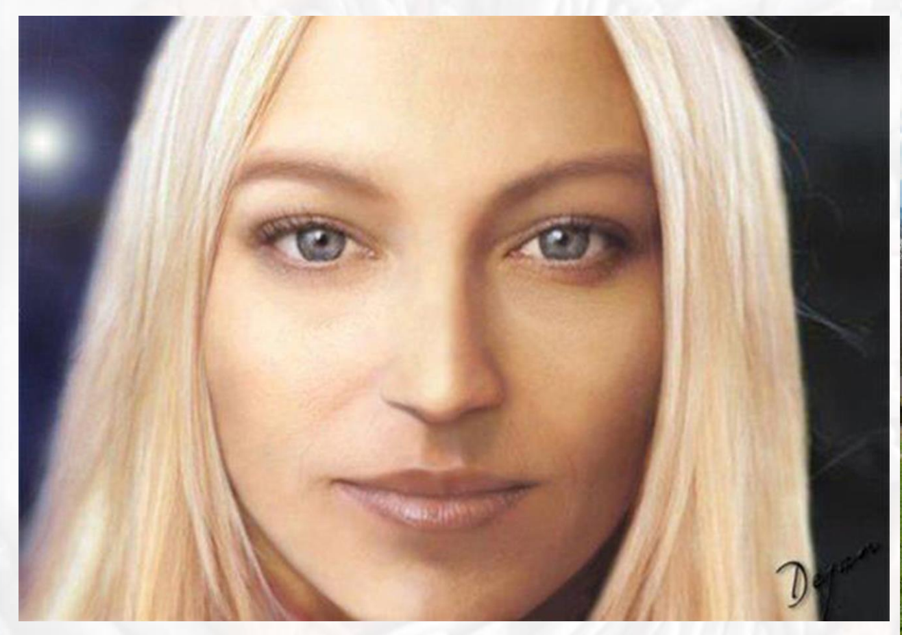
Portrait of Semjase, by Dejan.

₩ https://shop.figu.org/b%C3%BCcher/der-billy-meier-fall-wahr-oder-betrug-the-billy-meier-case-true-or-a-hoax?