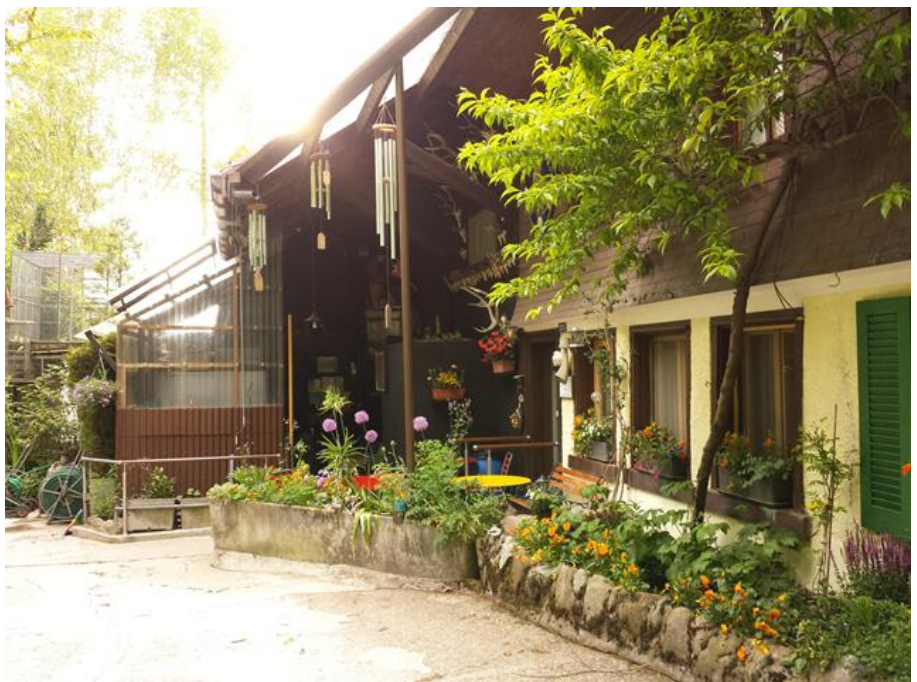
Picture of the front entrance, seating area & aviary - Semjase Silver Star Center

Fortunately we have stuck with it (sometimes it hasn't been easy) but our small Group is in a good place at the moment. We have a small but regular set of attendees, we have set our tasks and we carry them out to the best of our ability, we have a good, respectful and fun atmosphere in the Group and we learn and benefit from each other, all the while we analyse our output and try to find improvements. We are certainly not perfect but that's the point, we are willing to learn and want to do something to contribute to our own individual evolution as well as to that of the FIGU Mission.